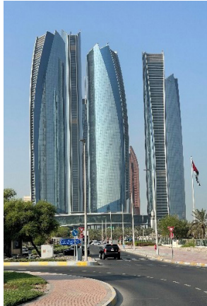
The convention center in Abu Dhabi, United Arab Emirates.