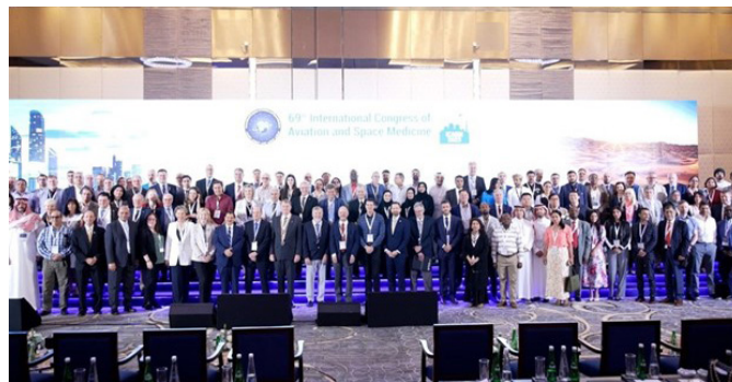
Attendees at the Congress.

The hospitality and professionalism of the ICASM 2023 team and UAE hosts were outstanding. There were many international speakers, including a significant number of current