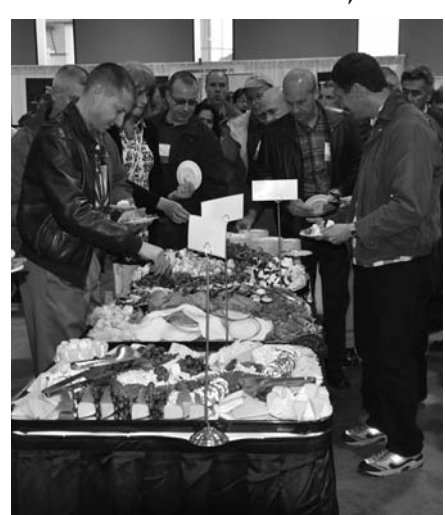
WELCOME RECEPTION-- Sponsored by Mayo Clinic.