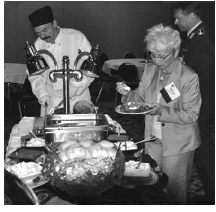
ASSOCIATE FELLOWS/FELLOWS RECEP- TION-- Sponsored by Wyle.