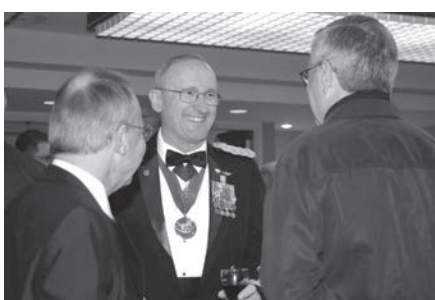
HONORS NIGHT-- Members and guests put on their finery to attend the Honors Night reception, banquet and awards ceremonies. Pictured above are just a few of the nearly 500 attendees.