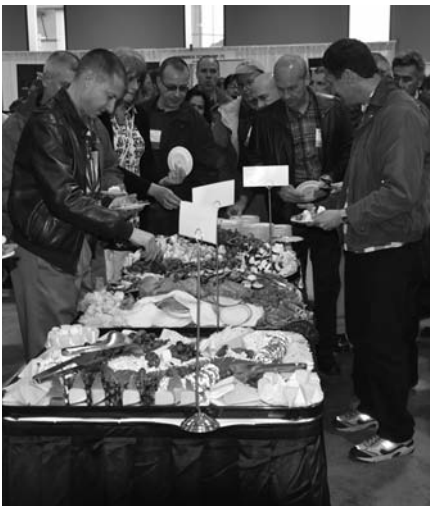
WELCOME RECEPTION-- Sponsored by Mayo Clinic.