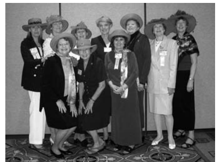
2005--Kansas City-- Ladies of the Red Hat Society.