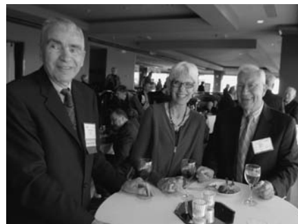
PRESIDENT'S RECEPTION-- Sponsored by Harvey Watt & Co.

For more Annual Meeting photos, check out the photo galleries in the Members Home section of our web-site at www.asma.org.