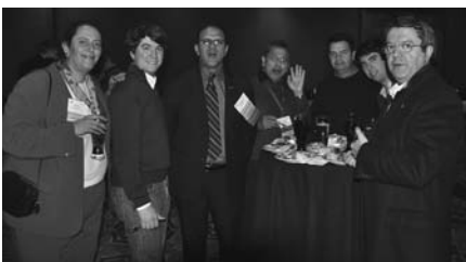
RECEPTION TO HONOR INTERNATIONAL MEMBERS-- Sponsored by ETC.