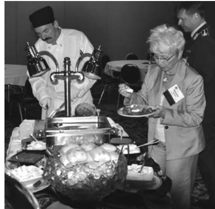
ASSOCIATE FELLOWS/FELLOWS RECEPTION-- Sponsored by Wyle.