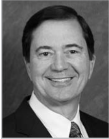
JOHN PAUL STAPP AWARD