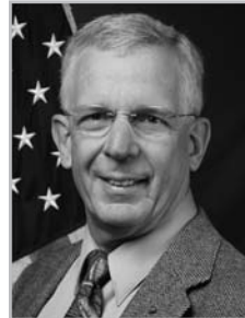
ERIC LILJENCANTZ AWARD

A Fellow of the Aerospace Medical Association, he has served on the Editorial Board of Aviation, Space, and Environmental Medicine , and published over 40 papers, articles, and scientific presentations.