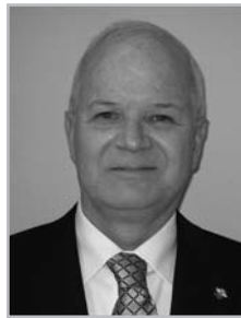
JOHN A. TAMISIEA AWARD